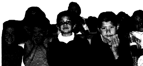
Children waiting for Saturday "Feeding" to begin