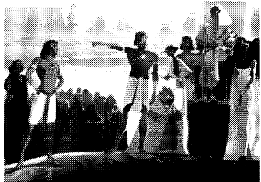
Moses confronts Pharaoh in "The Prince of Egypt."

In between the "work" of the day, we plan to enjoy God, each other, some good food, and the gift of solitude. The idea of a "day off" is a foreign concept to these women who expect to work seven days a week year round. What a privilege to spend not only the day together but to enable our friends to take a well-deserved "day away!"